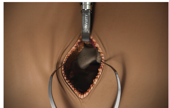
WITHOUT INTELLIGENT PHOTONICS