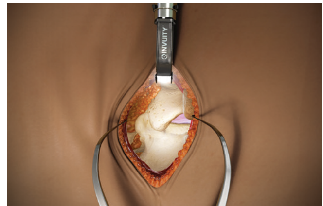
WITH INTELLIGENT PHOTONICS