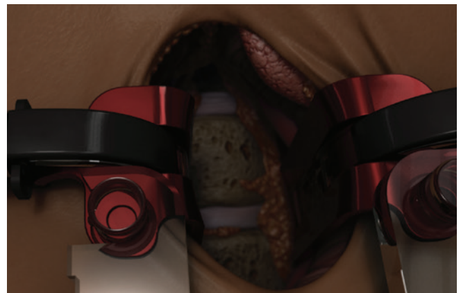
WITHOUT INTELLIGENT PHOTONICS