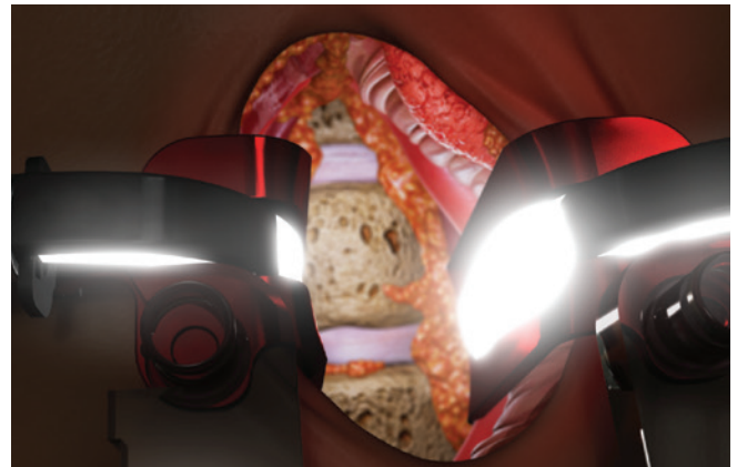
WITH INTELLIGENT PHOTONICS